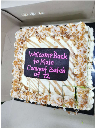
Pandan cake made and decorated by a teacher for our tea!